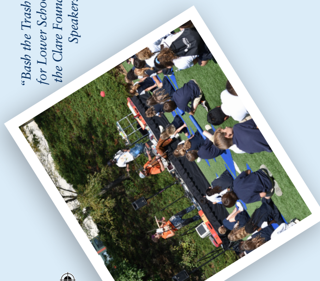
"Bash the Trash" performed for Lower School as part of the Clare Foundation STEM Speakers Series.